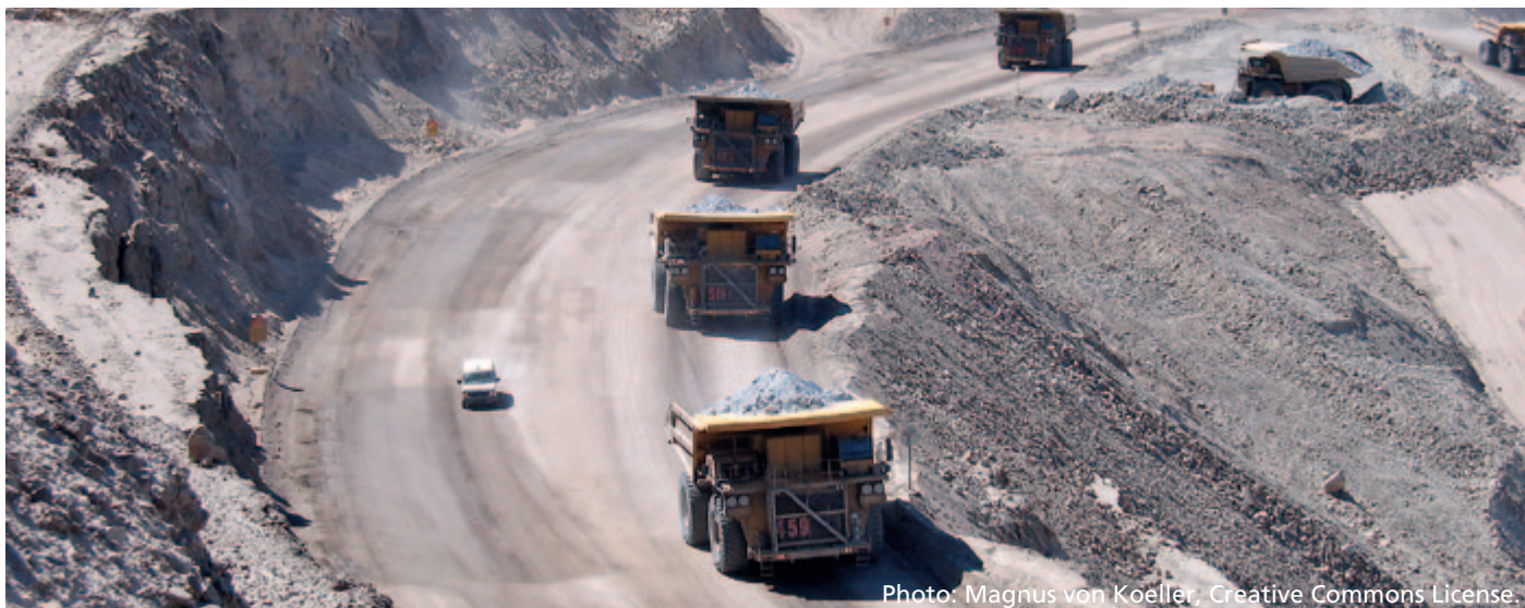
Fig. 1: Goods exported from Africa and Europe